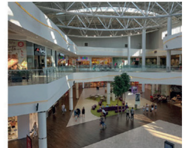
Handrails and handles in shopping malls

PLEASE CONTACT ACT ON 029 2081 7900 TO TALK ABOUT HOW TO PROTECT YOUR SURFACES USING