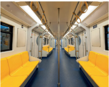
Handrails and handles in public transport (subway, bus, train etc.)