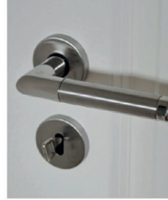
Door handles, switches etc.