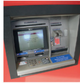
Automatic dispensers (drinks, money..) and coffee machines