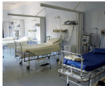
Handrails and handles in hospitals and retirement homes