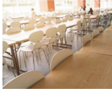
Break rooms and dining halls